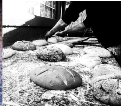
Photo Forno Popolare Casetta Rossa