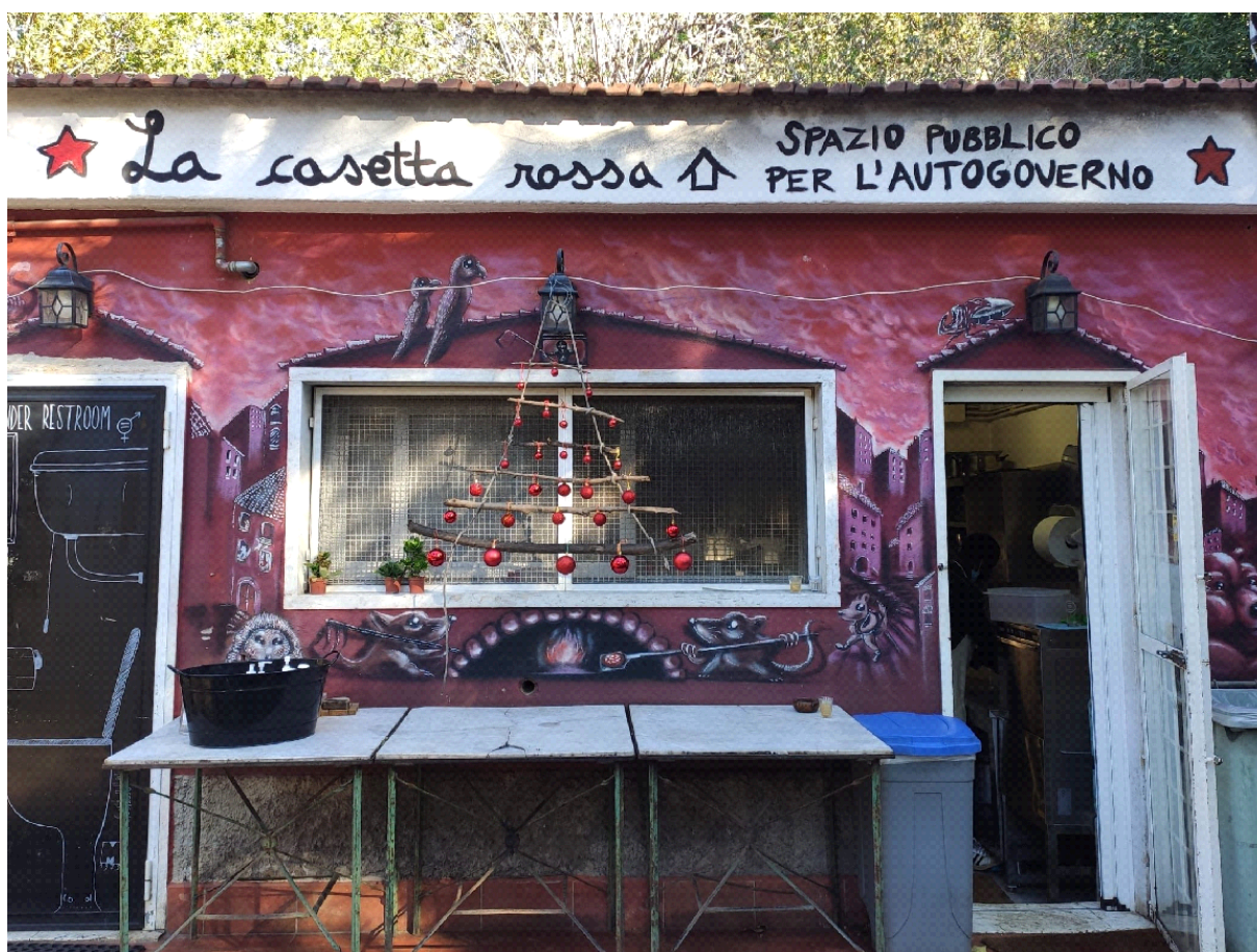
Photo of Casetta Rossa