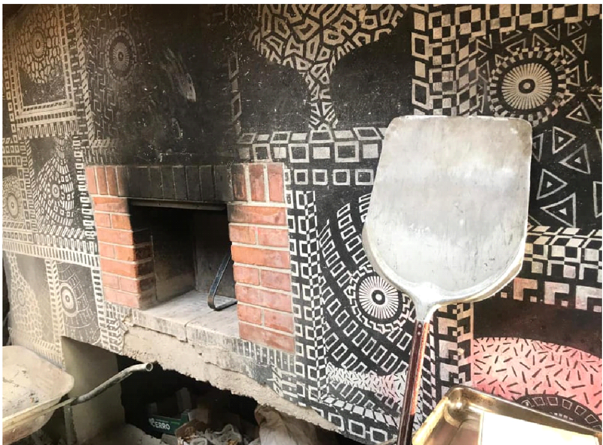
Photo Forno Popolare Casetta Rossa – public photo taken from the Casetta Rossa Facebook page