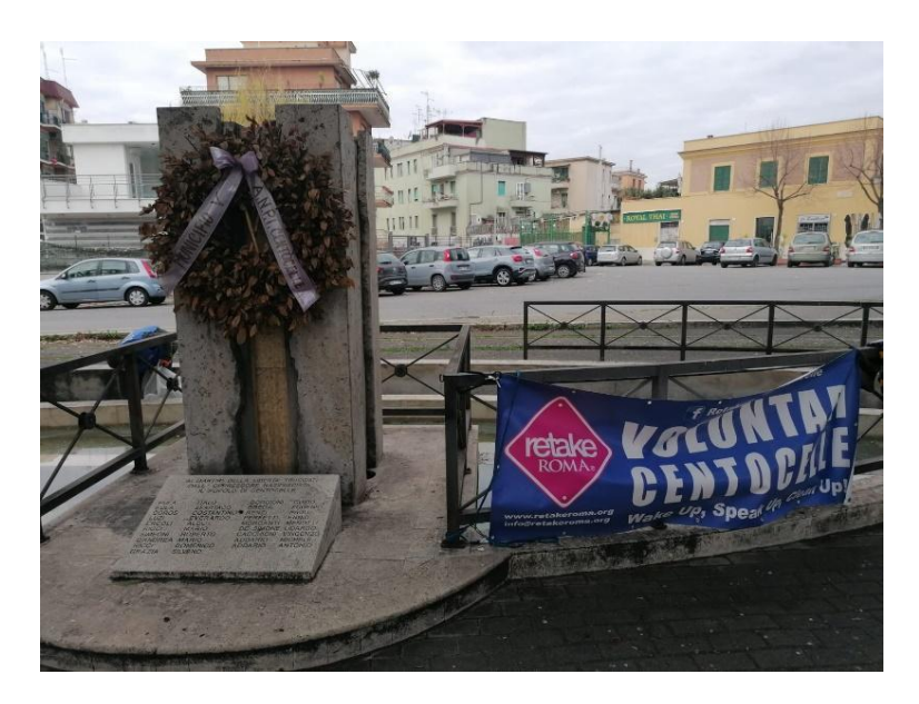
Square dedicated to the martyrs of freedom slaughtered by the Nazi-fascist oppressor, cleaned up by Centocelle volunteers (December 2023)

The beneficiaries of Retake actions are citizens who, not only can experience environments visibly more livable but also can breathe cleaner air.